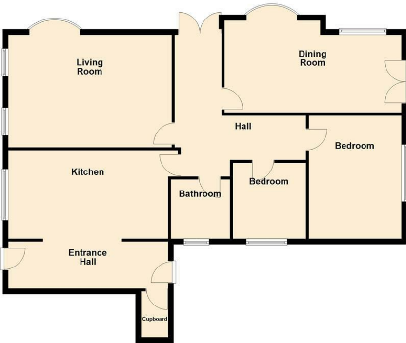
Ground Floor Approx. 119.8 sq. metres (1289.0 sq. feet)